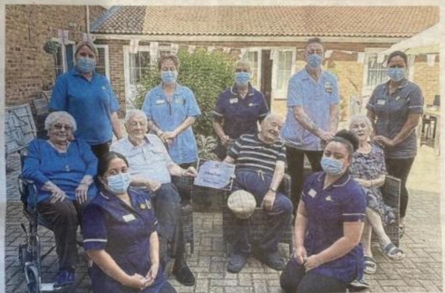
■ Care home - residents at Silvana Court